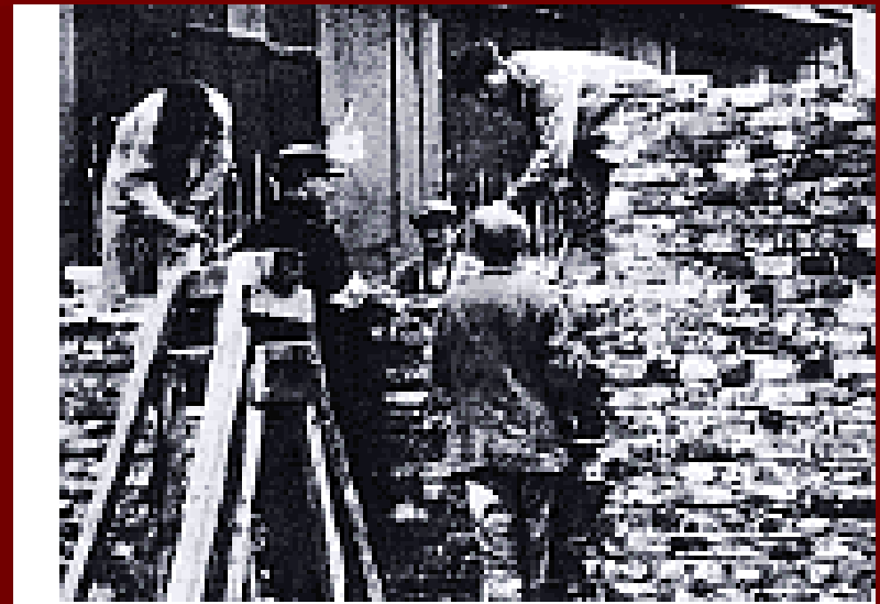
Sealing the Warsaw Ghetto

■ All ghettos had the most appalling, inhuman living conditions. The smallest ghetto housed approximately 3,000 people. Warsaw, the largest ghetto, held 400,000 people. Łódź, the second largest, held about 160,000. Other Polish cities with large Jewish ghettos included Białystok, Częstochowa, Kielce, Kraków, Lublin, Lvów, Radom, and Vilna.